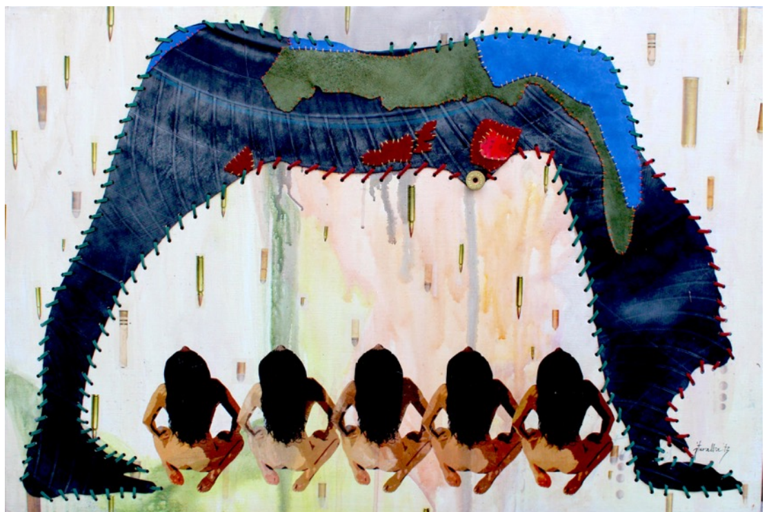
Hold a Thousand Souls, 2013 Shotgun, gold-dipped brass bullet shell casings, leather, rubber, acrylic on canvas, 70 x 120 cm