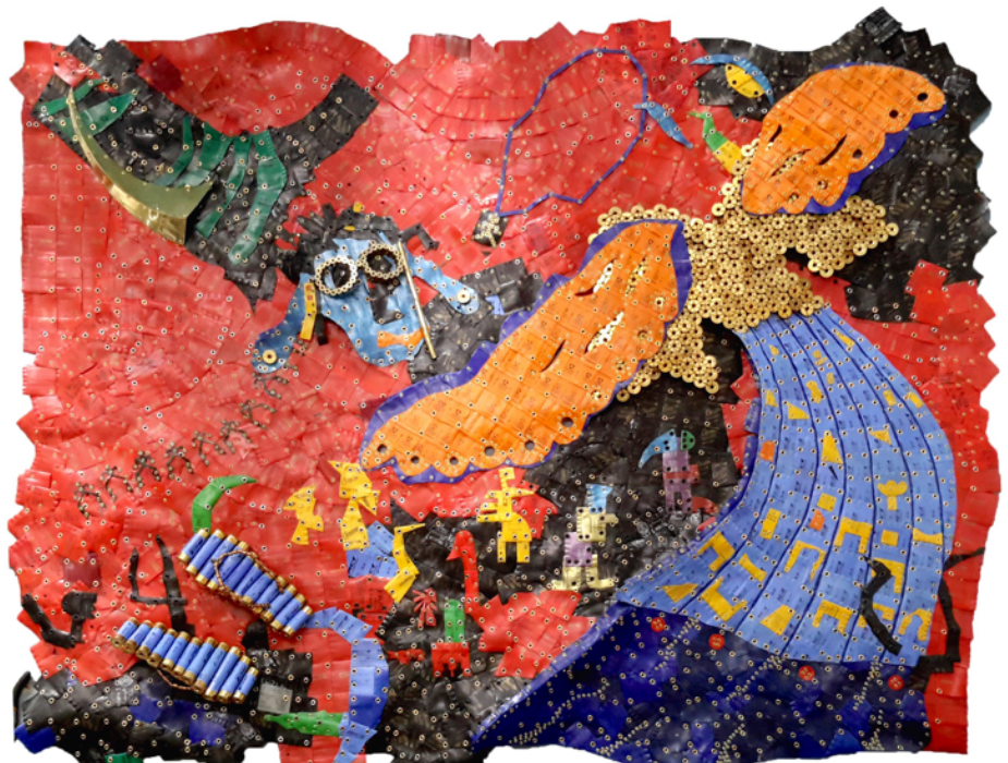
Terminal Velocity, 2014 shotgun .45 calibre brass bullet casings, brass, 120 x 150 cm