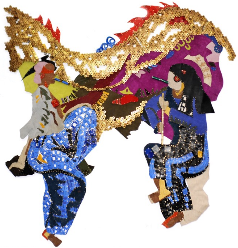
Kwentuhan Ng Anghel (Stories with Angel), 2013 Shotgun, gold-dipped brass bullet shell casings, leather, 215 x 210 cm