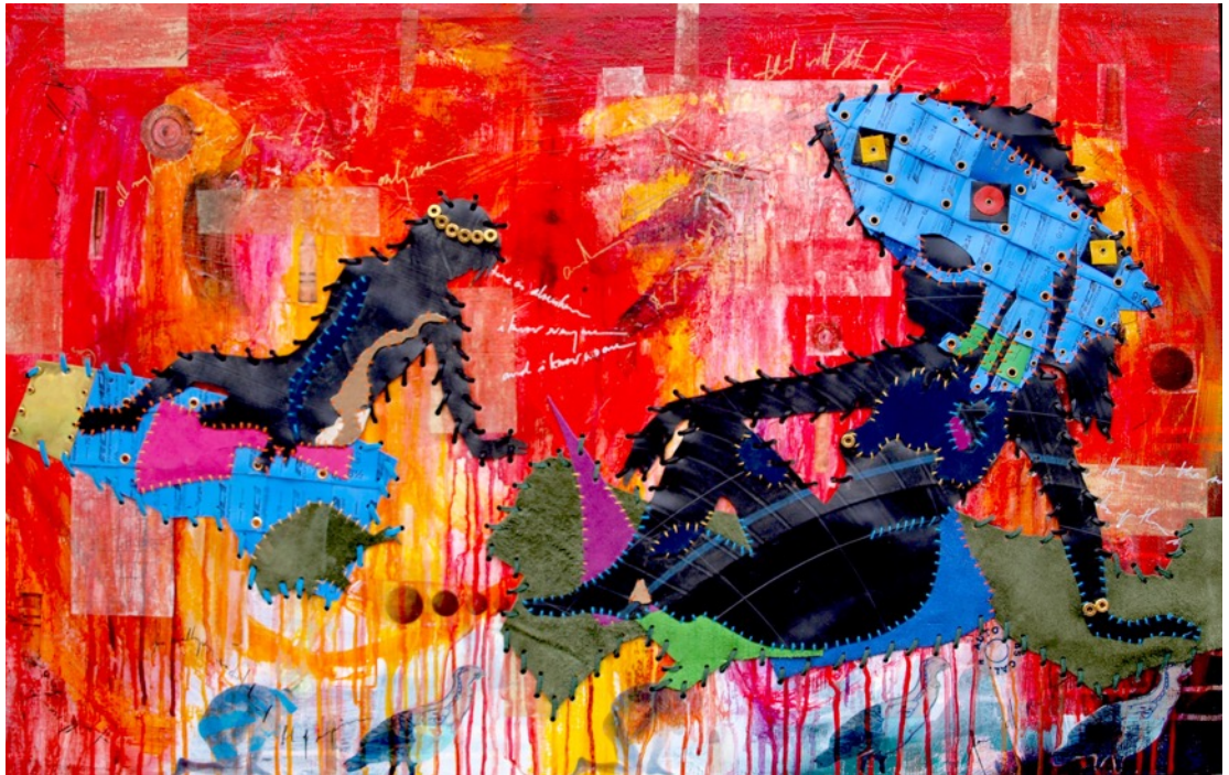
Holdover, 2013 Shotgun, gold-dipped brass bullet shell casings, leather, rubber, acrylic on canvas, 60 x 90 cm